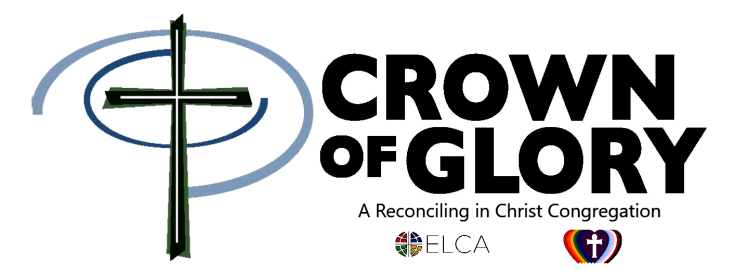
We are one family of God, inspired by the Holy Spirit to welcome everyone, to serve our neighbors, and to share God's love and saving grace.